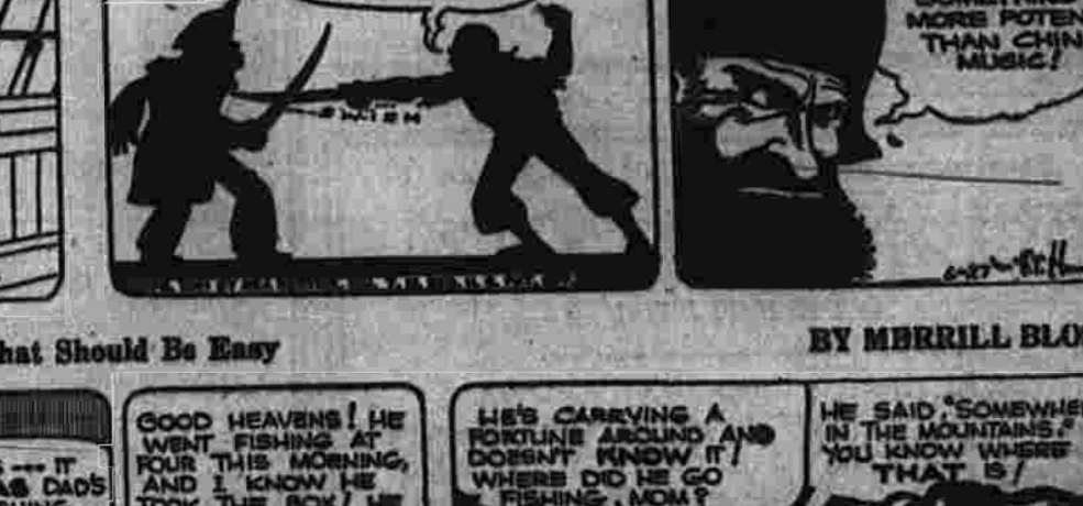
V. T. HAMLIN

WASH TUBS What Can It Be? YOU WANT TO SPOIL EVERYTHING? YOU WANT TO SPOIL EVERYTHING? YOU WANT TO SPOIL EVERYTHING?