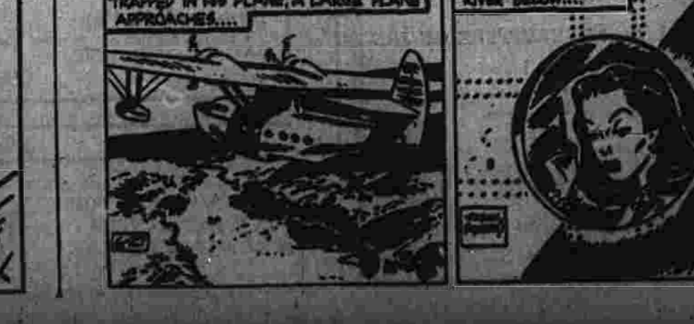
V. T. HAMLIN

WASH TUBS What Can It Be? YOU WANT TO SPOIL EVERYTHING? YOU WANT TO SPOIL EVERYTHING? YOU WANT TO SPOIL EVERYTHING?