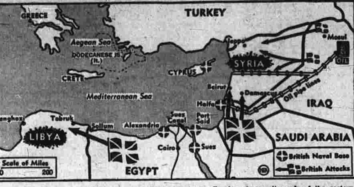
British troops have a two-fold purpose in their two-front offensive at opposite ends of the eastern Mediterranean theater.